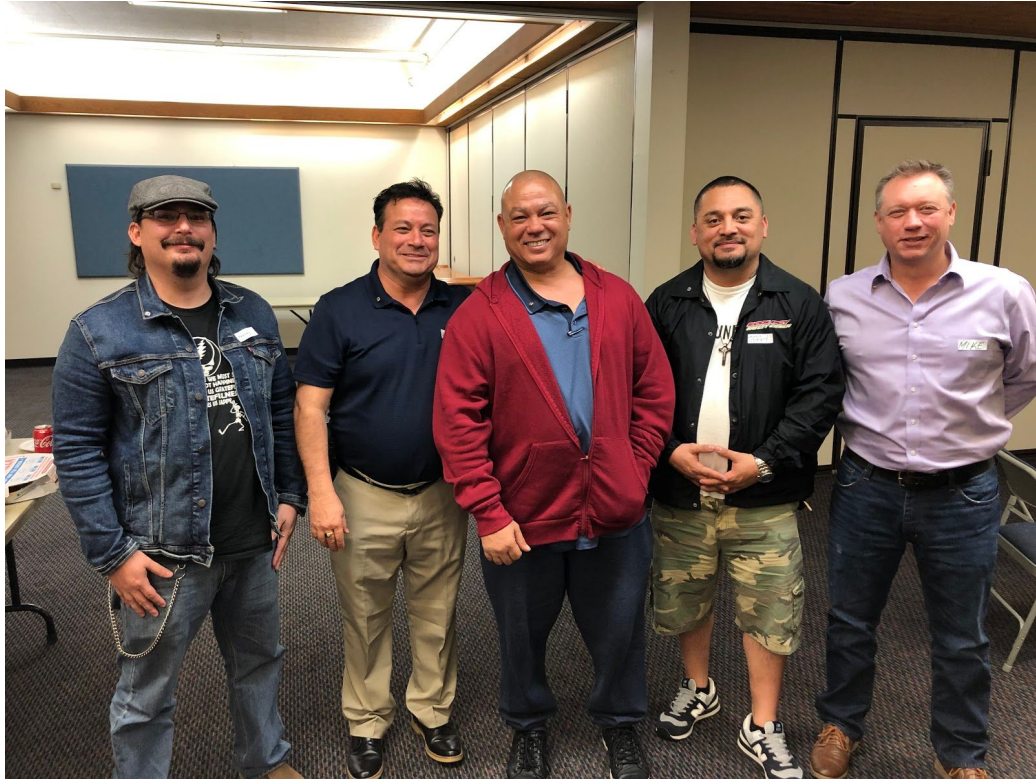
Officers for Inceptive 1st Degree